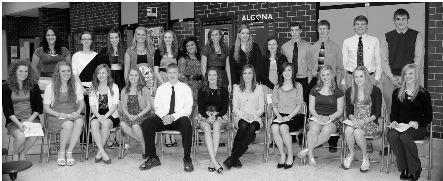
Above: Current & new Algona NHS members.